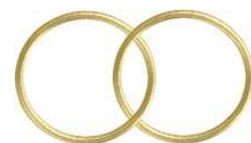
Inner Twins Rings